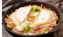
A tartiflette, yesterday

The_Ed is delighted to welcome the return of Gordon to these hallowed pages. Each month he will trawl the surrounding area to sample various eateries.