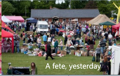
A fete, yesterday

Household Bin Collections: Bradley Common collected on Fridays. Rest of Birchanger on Thursdays. (Some exceptions)