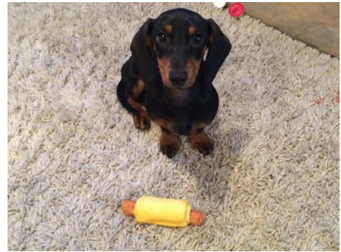
"Pure Rage in the Eyes"