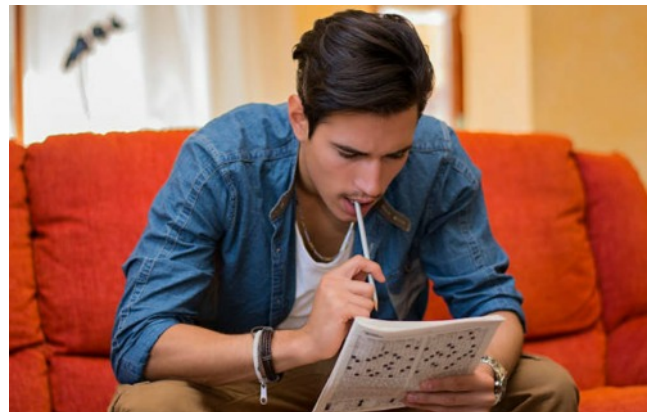
A man doing a crossword in the village, early yesterday, placed purely to fill up the gap under the second puzzle.

If you get stuck, email The_Ed and tell him how much you enjoyed failing. Or, wait for the answers next month.