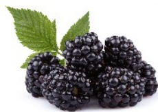
A lazy repeat of the picture from page 2

Always ask the landowner before stealing fruit, or grow your own in the Birchanger allotments like normal non-criminals.