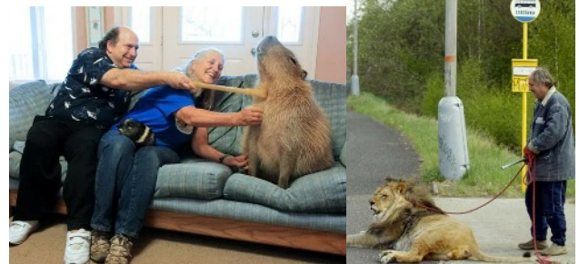
Some pets around Birchanger, yesterday. Easiest way to guarantee a bus seat