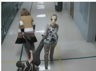
Children enjoying school, yesterday. Always drag your own.. The_Ed