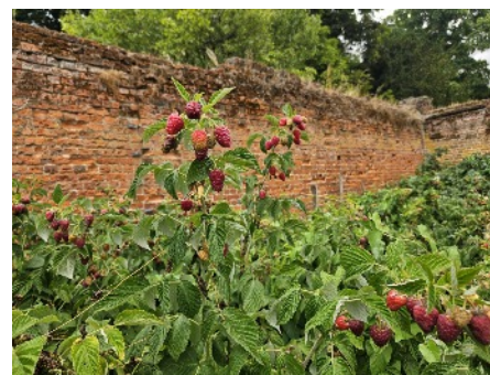
Raspberries ready to pick