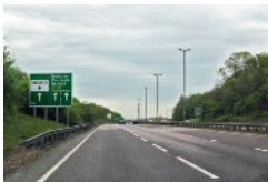
The A120, yesterday.

It's good to see Jay's pig roast was legendary, even 21 years ago. In this same month was the announcement of the opening of the A120 bypass too, so a real thunderer 'can't put it down' edition of your favourite north Essex village magazine beginning with B.