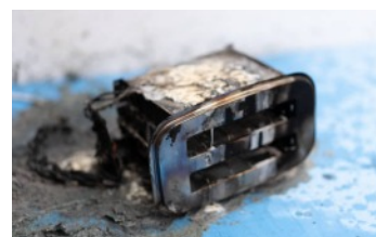
A broken messy toaster, yesterday

As this month's presses were rolling with the September edition of the magazine news came through from Birchanger Parish Council that villagers can now leave SMALL electrical items (that would fit in a supermarket bag) out for the bin men to collect. Either on recycling or non-recycling days, just leave on top of your bin. So, if you have that dodgy kettle, a broken toaster, a worn out electrical whisk, or any other item of similar size - you can now dispose of it that way.