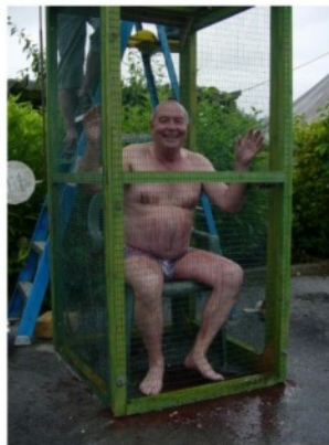
Hang on Dave, the UN inspectors are just down the road!

Many of the visitors remarked on their preference for the pub as a venue due to the compact nature of the garden and a general feeling of togetherness it generated.