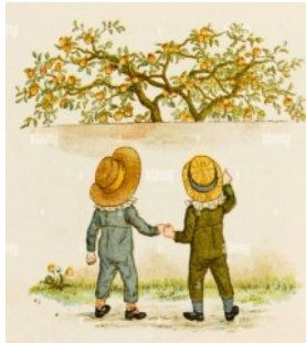
Kids scrumpling in Birchanger, yesterday

The Birchanger bushes are bursting with soft fruit and what better time to plunder some of that juicy flesh than September. This month, to kick us off with the series, Mrs The_Ed shares a recipe for BlackBerry jam.